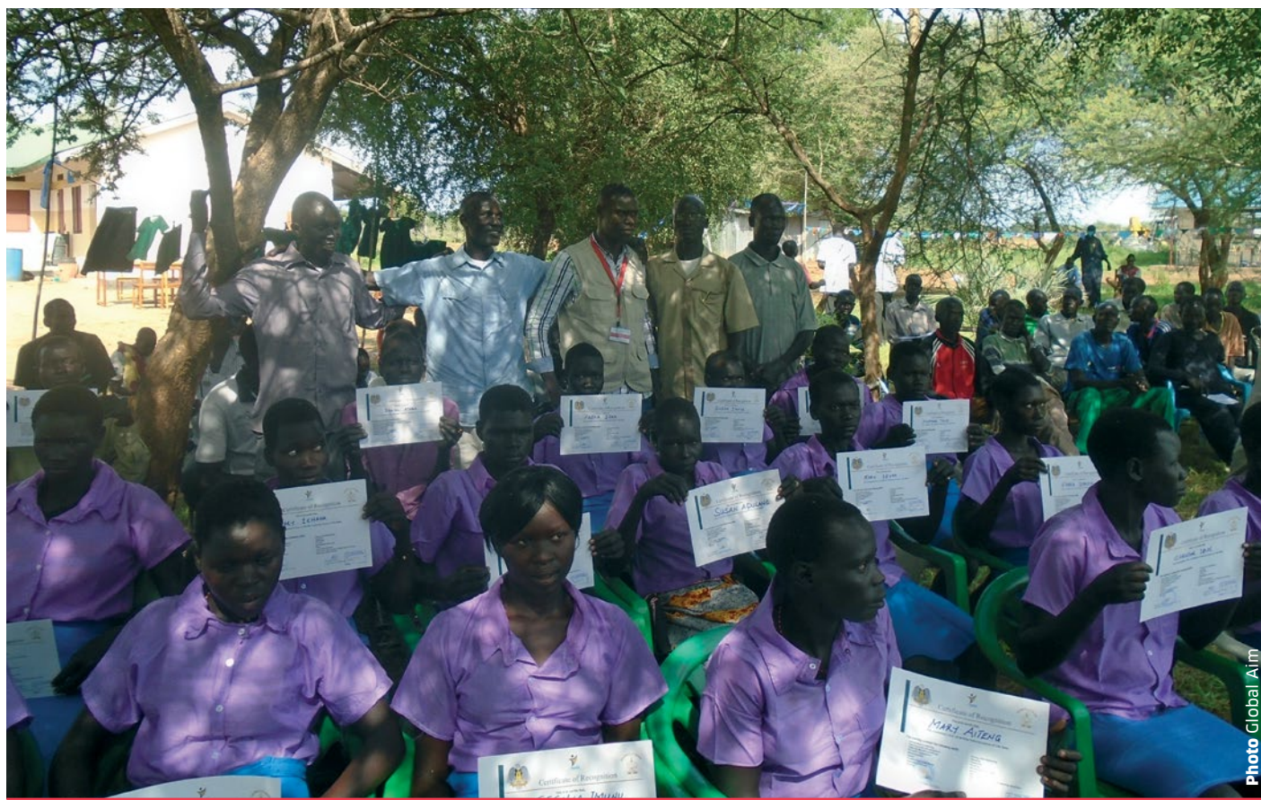
Graduation of tailoring class.

More development actors should offer skill training programs in order to address youth unemployment because. Skill training proves to contribute to a reduction in crime perpetrated by youth. These kind of programming is in need for a strong link to dialogue and peace initiatives. Youth should be encouraged to form groups so that they can be more easily accessible and supported after programs end.