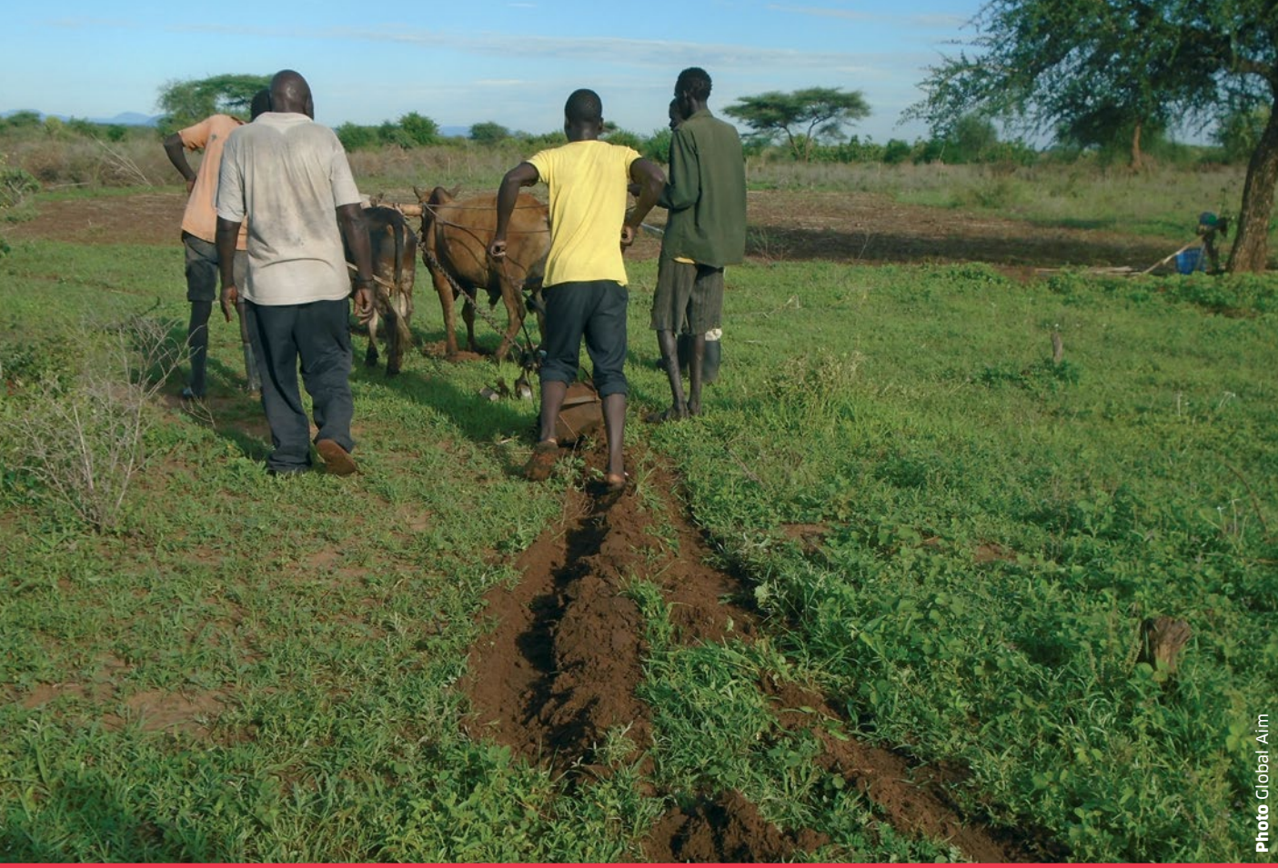
Training on ox-traction.

That is why Global Aim promoted the use of ox-traction as labor saving strategy. A total of 120 lead farmers, including men and women, were trained in how to use the oxen. These trainees then trained other group members. They received ox-ploughs and oxen, hoes, pangas, seeds and watering cans. Furthermore, the trainees were equipped with business skills focused on hiring out the ox-ploughs to other community members as an income generating strategy.