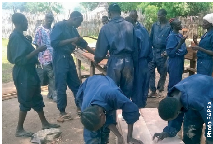
Boys and girls learning practical skills.

For example, one trainee from Tirrangore had joined an armed group to raid cattle. He served in the frontline of the recent inter-communal conflicts between Tirrangore and Murahatiha Bomas. When the peacebuilding and community livelihood rehabilitation program started in Hiyala Payam, he enrolled in the skills training. “After graduating from the training, I now established two carpentry workshops. As youth team leader I advocate for peace. I reach out to other youth to join vocational training and encourage them to denounce criminal activities”, he says.