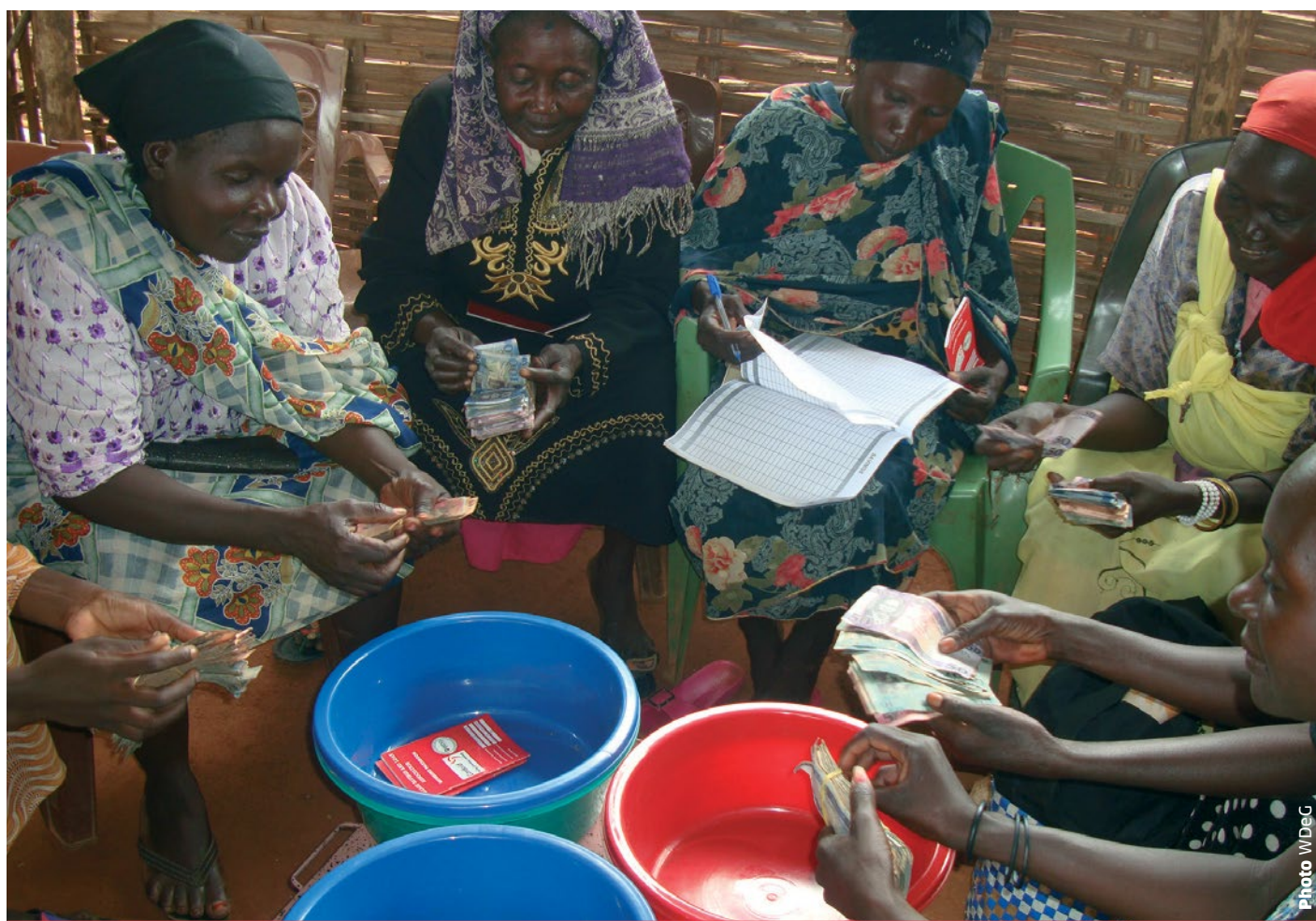
Women from the VSLA group in the PoC camps come together to save money. They keep this in an iron box and keep record of what they save.

When the conflict broke out, Women Development Group (WDG) had just started the set-up of Village Savings and Loan Association (VSLA), and decided continue activities from the camps and shelters where the beneficiaries had taken refuge.