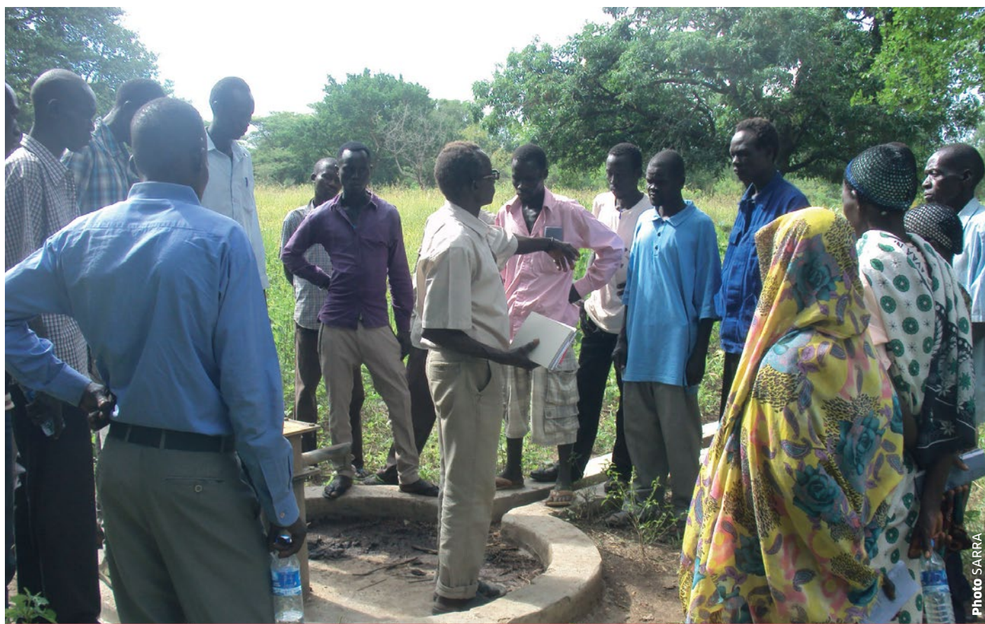
On site training of the water management committee in Luodo.

With the aim to advocate for peace, SARRA organized a community meeting in Loudo Boma. The Torit County Commissioner chaired the meeting and village chiefs highlighted the impact of conflict on the communities. Following the meeting, a community needs assessment was conducted in Torit County. This led to an agreement on several actions that could help bring peace: relocation of the Loudo Boma villages to their ancestral areas, construction of schools and health units so that the children have access to proper education and health care, and drill boreholes to enhance the availability of water.