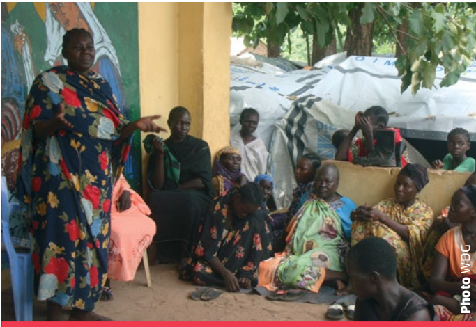
The chair of the women network now residing in Lokloko PoC camp addresses the women's network to identify the needs of women in the camp. Health services and economic empowerment were mentioned as core needs.

'Barometer of local women's security'. The Barometer builds on earlier training conducted on Community Managed Disaster Risk Reduction (CMDRR). As part of the Barometer approach, WDG trained the women networks on topics such as lobby and advocacy, gender and leadership, sexual and gender based violence (SGBV), access to justice and human rights. They also supported each network with 15 telephones, solar power devises and bicycles to improve their means of communication and timely response. Local DRR/peace committees, including chiefs and other community leaders, also participated in the trainings. WDG was also able to establish five other women networks in displacement centers in Wau County.