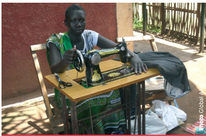
Student from tailoring class

advise other youth to be like them and desist from criminal activity. As a result, in Hiyala Payam the number of youth involved in petty crime and cattle raiding has sensibly reduced. Apprenticeship and skills training is thus a viable strategy to curb youth involvement in conflict, transforming them into peace builders.