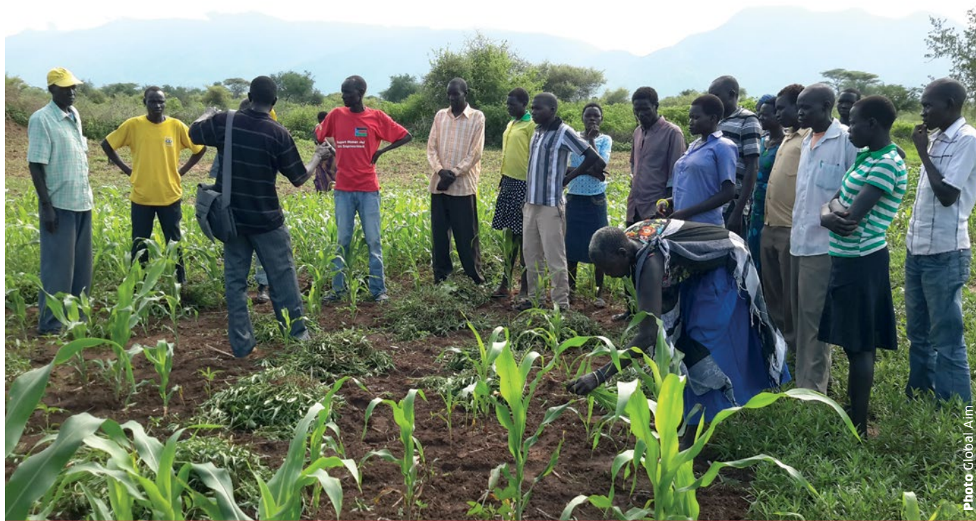
Farmers in Nyibira Boma on an exchange field visit.

Global Aim initiated and facilitated community meetings, bringing together elders and local leaders from the two villages to develop a joint action plan for restoring peaceful coexistence amongst the communities. They realized that their problems are interconnected and it motivated them to lobby for the support from developmental partners to address the needs for water and food production. The 'peace dividend' plan recommended, amongst others, to establish a farmers group comprising of members from the two villages and building a joint warehouse. The K-longole farmers group was formed with 30 members, half coming from Ifuda village and half from Ifuna village. A total of 30 acres of fertile land was allocated for joint farming activities to be carried out by the farmers group. The group was trained on good agricultural practices, group dynamics and leadership. They were later provided with agricultural inputs such as seeds and farm tools, and supported in hiring a tractor to plough the 30 acres of land. Global Aim also built a warehouse, aiming to facilitate farmers from both conflicting communities to store and handle their food produce, and also to carry out joint marketing. A warehouse committee was formed and trained on warehouse management and maintenance. Attention was also paid to conflict resolution skills, to enhance peaceful collaboration of the farmers involved.