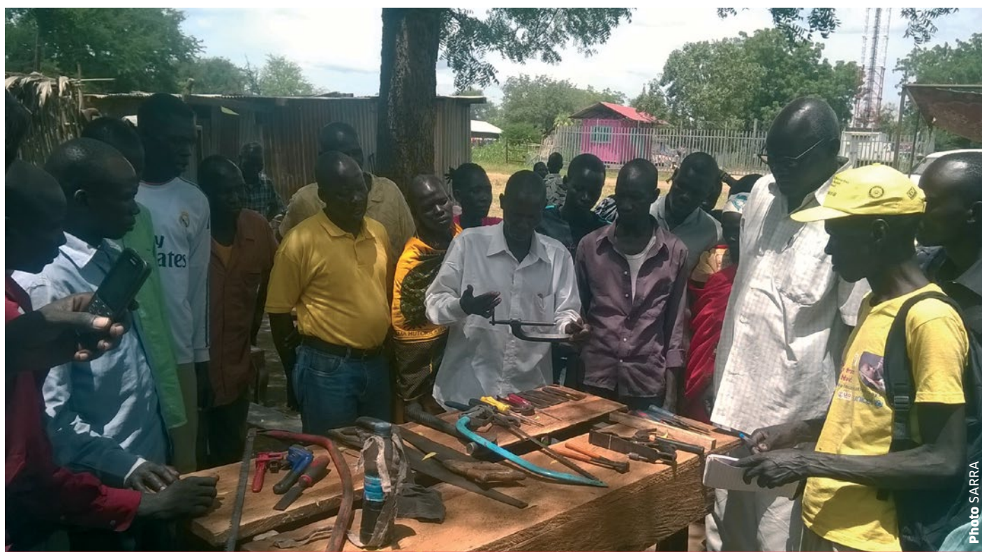
Vocational training in Torit.

In November 2016, SARRA conducted an exposure visit for the trainees to the State Ministry of Education, the State Ministry of Infrastructure, the State Ministry of Social Development and the office of the State Peace Commissioner. The visit was meant to familiarize the youth with the relevant line ministries of Eastern Equatoria State. Following these visits, the Director of Quality Education in the State Ministry of Education, Gender