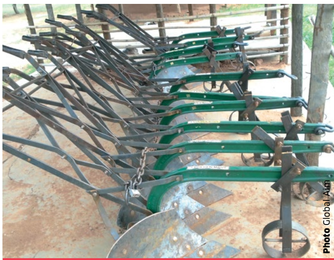
Ox-ploughs distributed by SARRA.