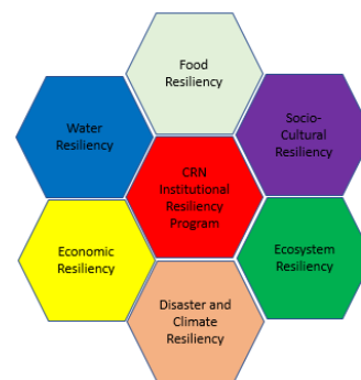
CRN; "Seven Strategic Pathways"

To guide the development of strategies for fulfilling our mission at the local, provincial and national levels, CRN has developed seven strategic pathways to resiliency. The pathways target specific issues: Food, Water, Economic, Disaster and Climate, Ecosystem, Socio-Cultural and Institutional Resiliency.