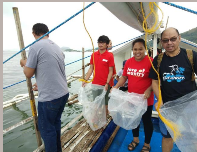
2018 CRN joined the coastal cleanup drive by the LGU in Coron