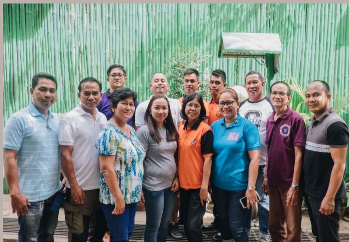
2019 CRN Execom meeting in Coron