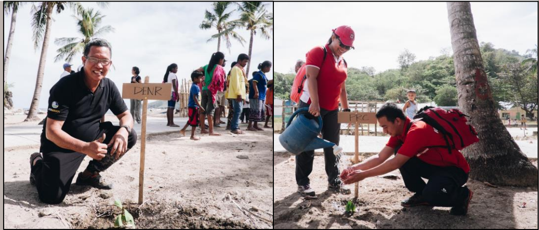
2019 CRN members tree planting during visit to the community of Malawig, Photo credits: Cordaid

Partners: The Calamianes Resilience Network & The Partners for Resilience