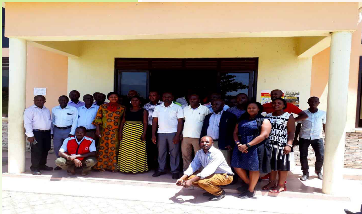
Group photo with participants