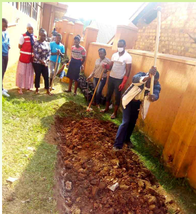
Digging the nursery bed