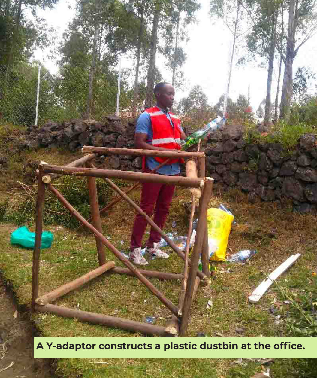
A Y-adaptor constructs a plastic dustbin at the office.