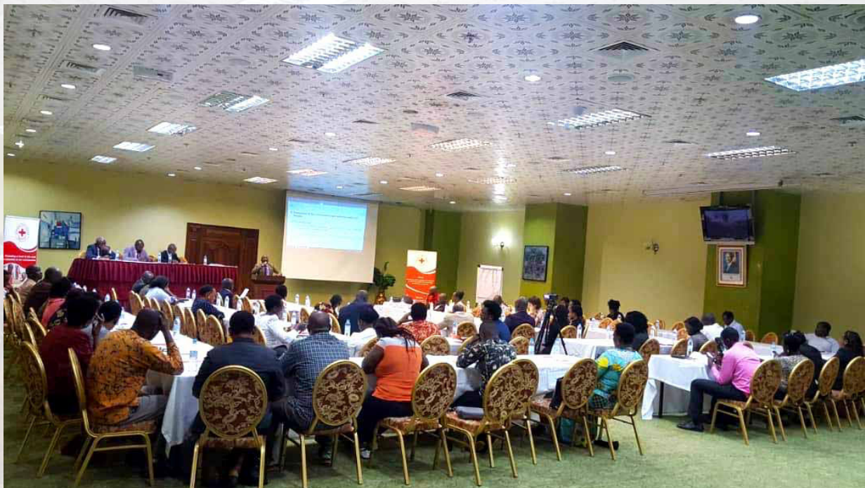
SG URCS engagement with Parliamentary Forum for DRR, CSOs OPM on National Disaster Bill