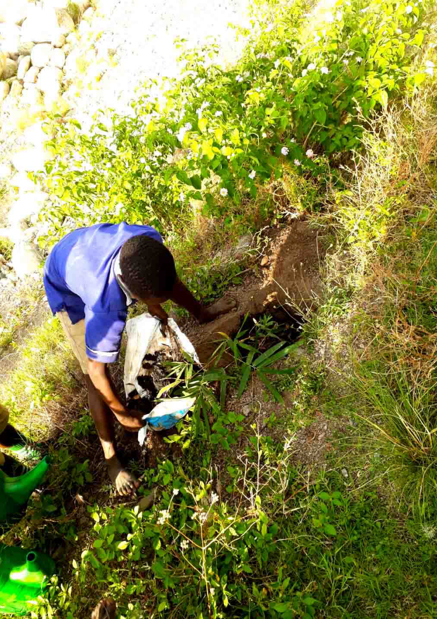
Young pupils were involved in bamboo planting