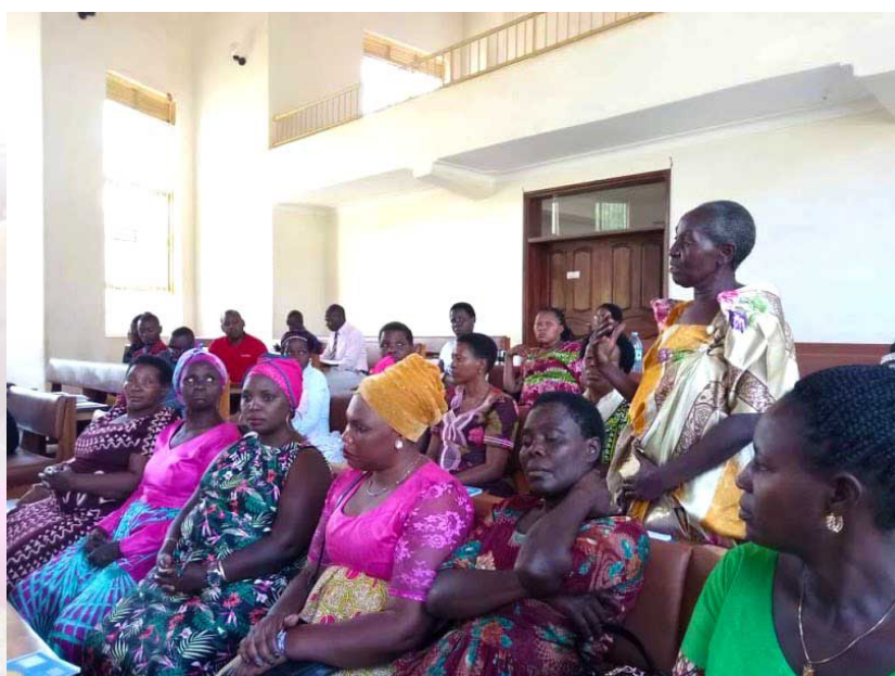
Leader of Women Group in Isingiro talks about Impact of climate change on their produce during Consultation to National Disaster Bill