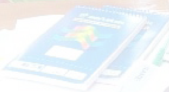
Eco- system game