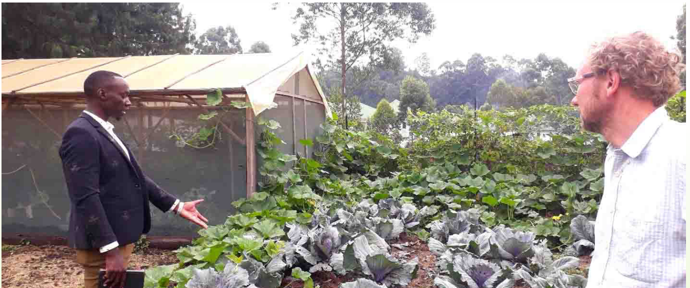
Issa a Y-Adaptor explains to the Christopher how seedlings are transplanted to the garden after being raised in a green house/nursery bed.