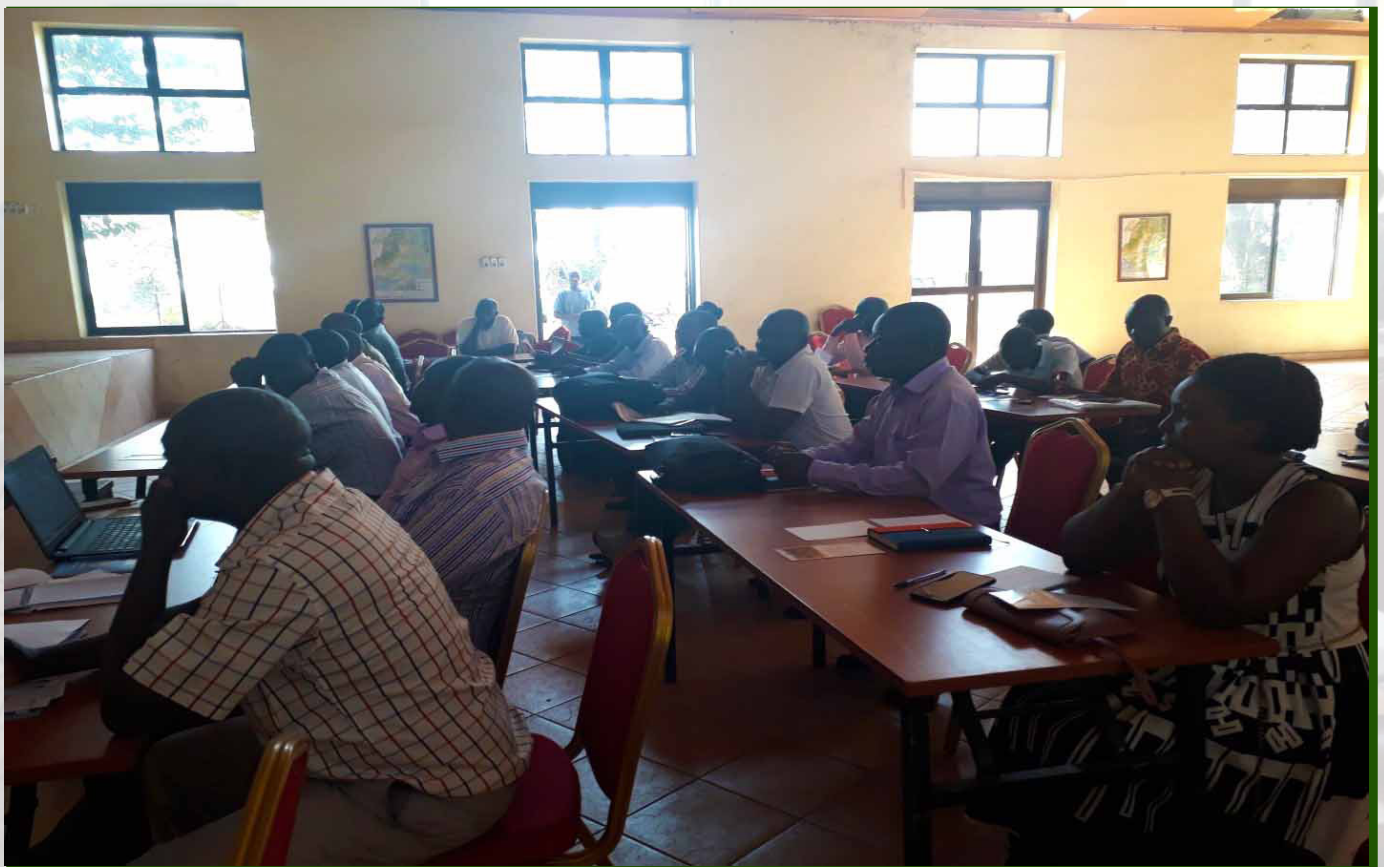
The district and subcounty leaders attending the training

DDMC TRAINING IN KASESE- ON 23 AND 24TH OF JANUARY 2019 WITH 32 PARTICIPANTS FROM THE DISTRICT, SUB COUNTIES AND KASESE MUNICIPALITY TO ATTEND AND DISCUSS THE RED CROSS ACT AND DISASTER BILL.