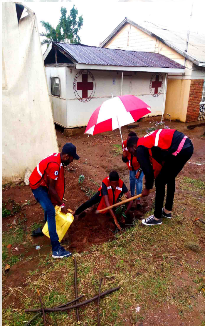
Youth planting Fruit trees at Mbarara branch 10th October 2019