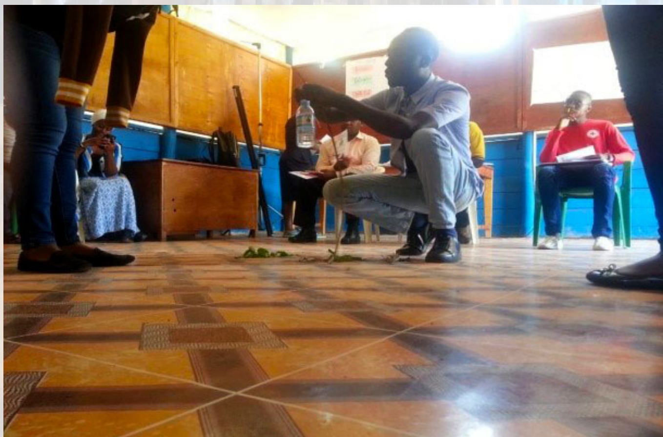
One of the participant demonstrating a drip irrigation method

Below are some of the pictures taken during the training.