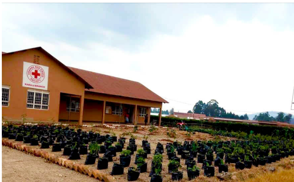
Climate Smart Backyard Gardening in Kabale-for Youths Volunteers in Climate Change Adaptation.