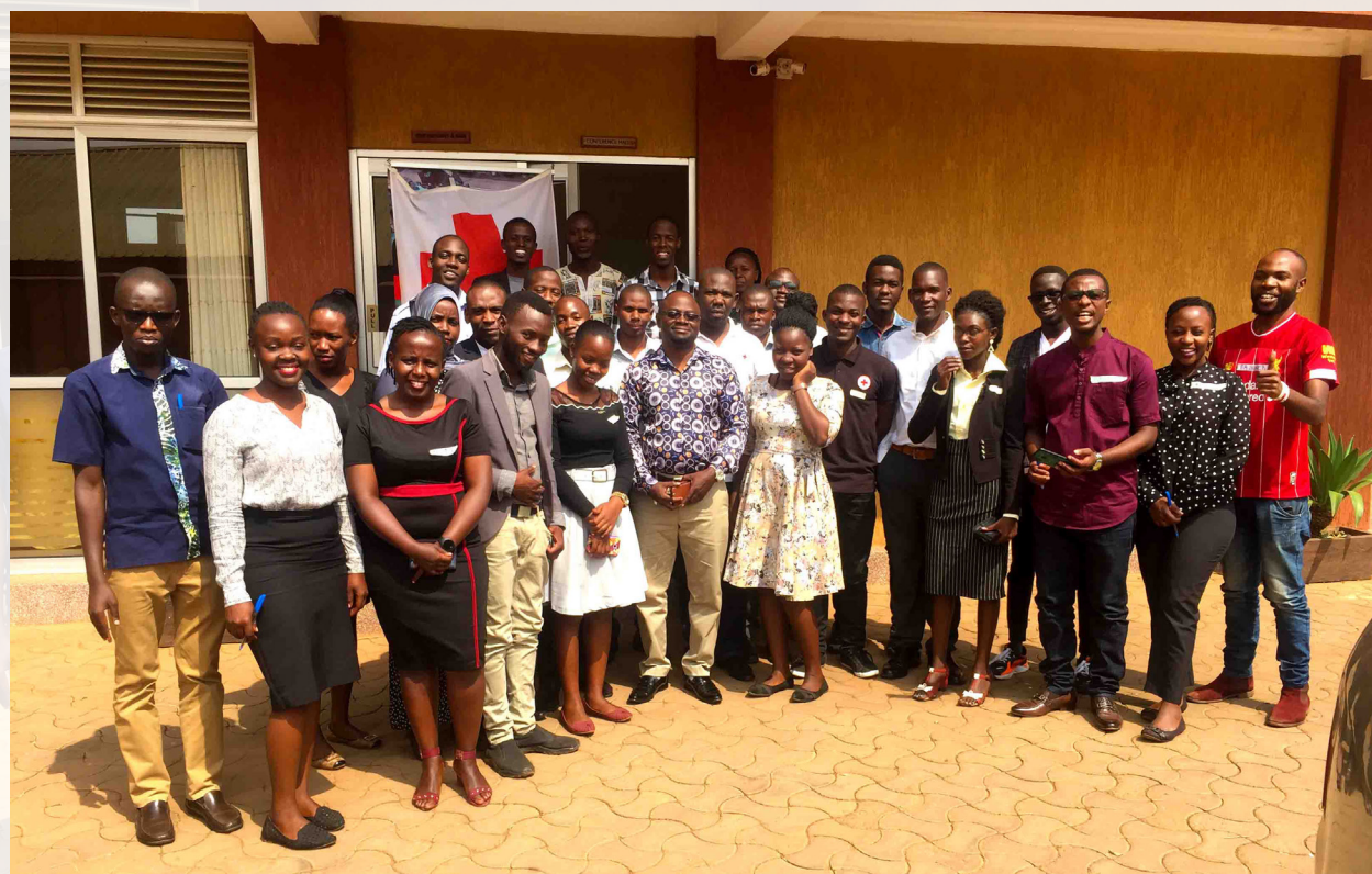
End of Y-Adaptor youth council training group photo.