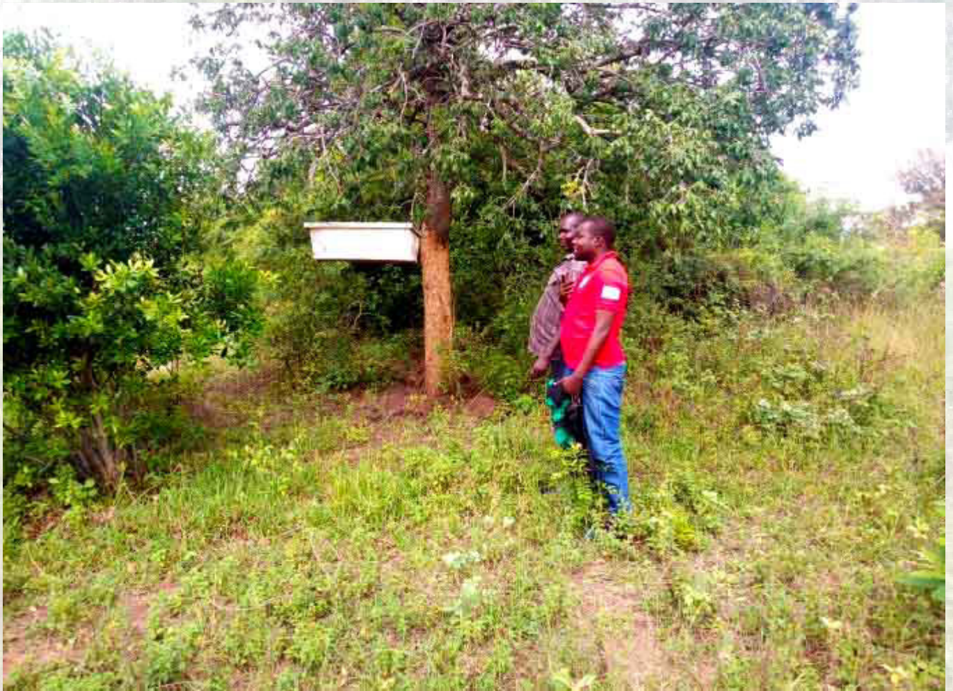
This project of Apiary is undergoing in Katakwi District.