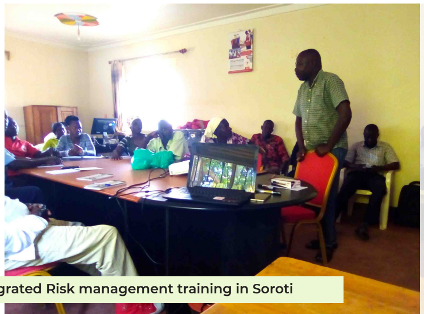
CBDRR Members undergoing an Integrated Risk management training in Soroti