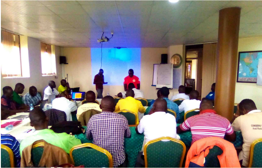
Members of the DRR platform for Teso attending a coordination meeting that was supported by PfR2 funds held in Soroti