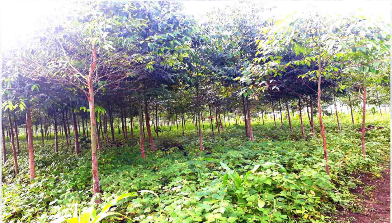
First phase of the trees that were planted in 2017