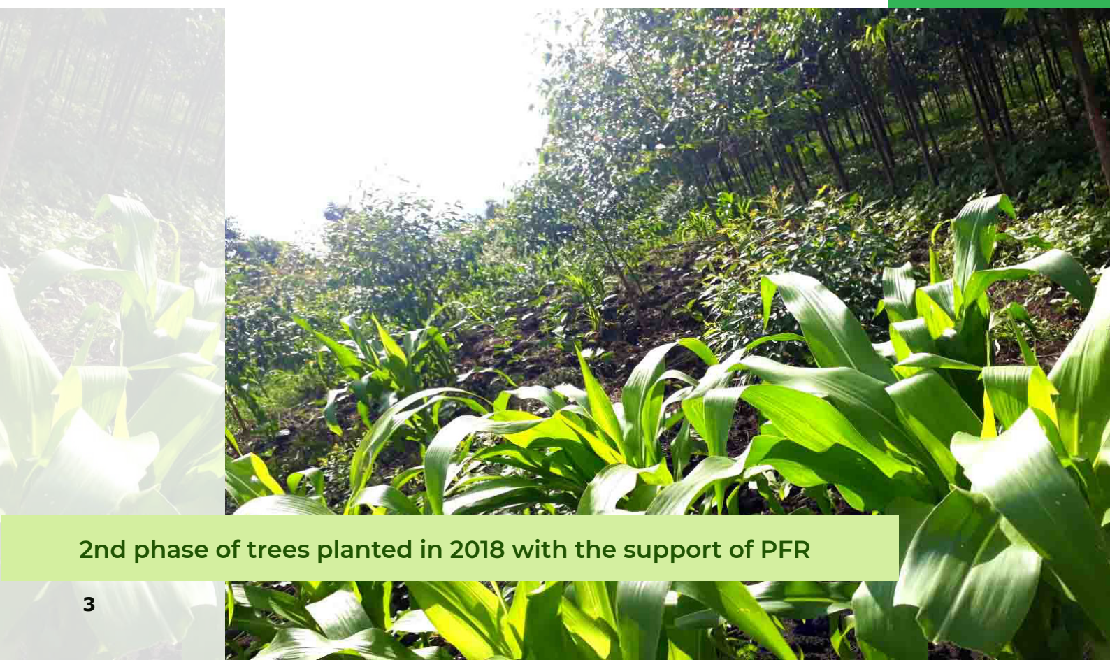
2nd phase of trees planted in 2018 with the support of PFR