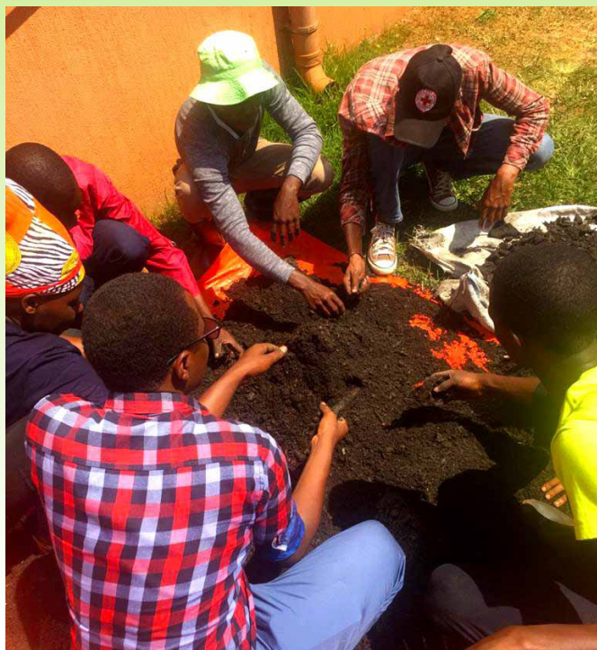
The team sorts and cleans the manure ready for the nursery bed