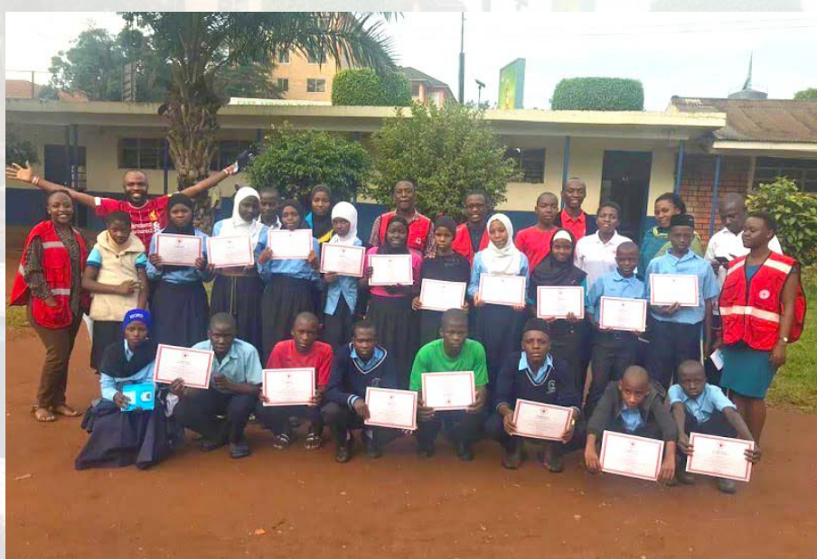
Aahmadiya Muslim High School Y-adaptors show off their certificates