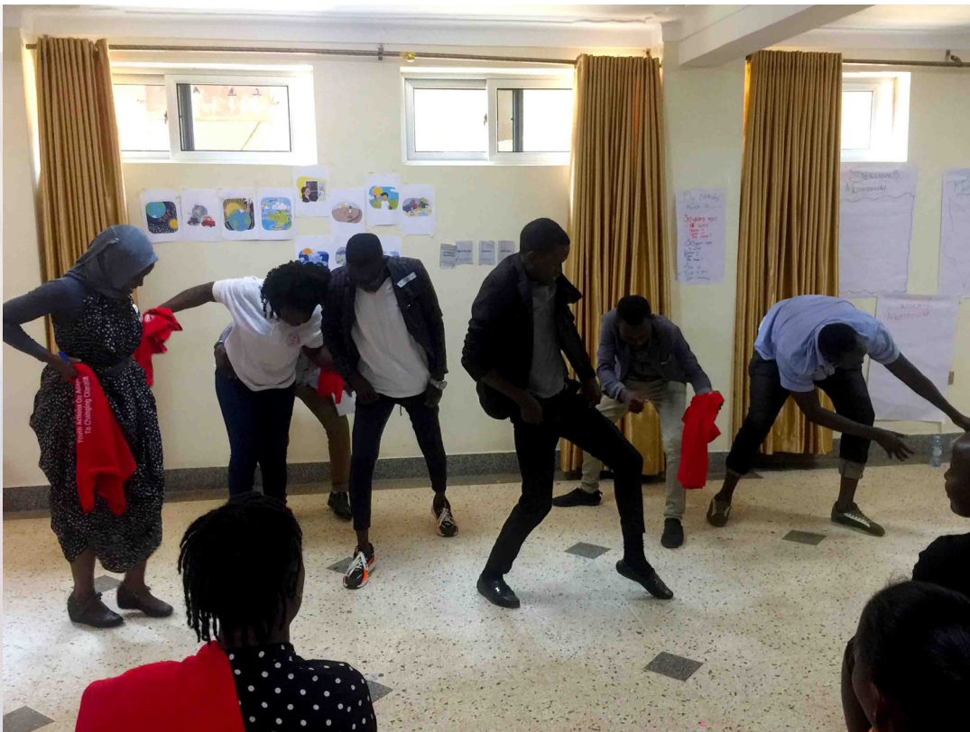
The branch youth council demonstrate periods before, during and after an extreme weather event.