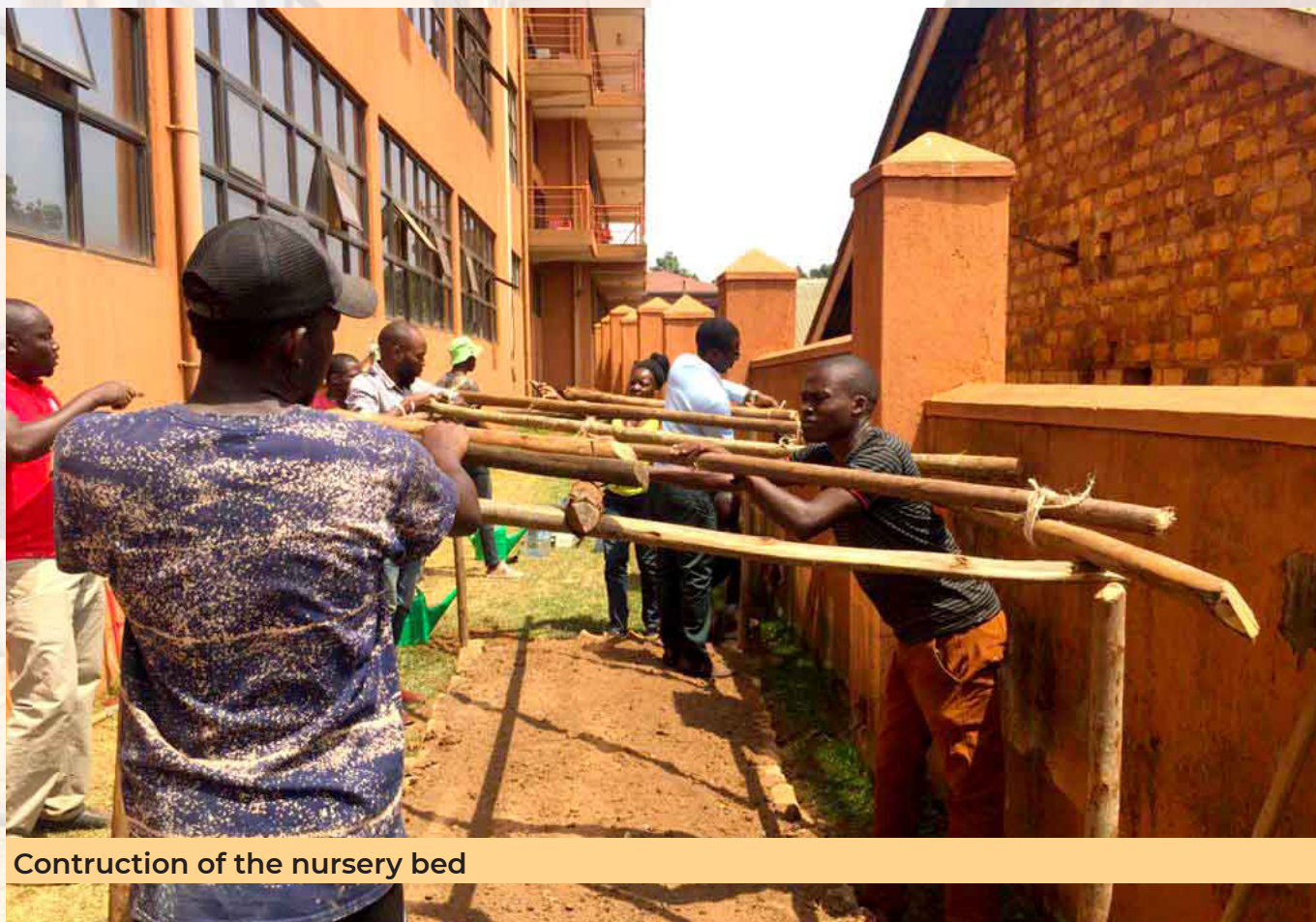
Contruaction of the nursery bed