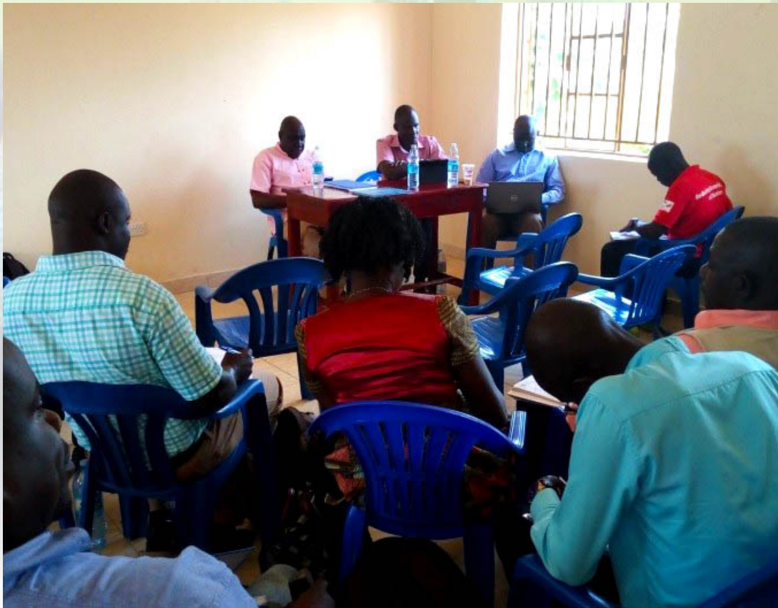
Ddmcs of Kapelebyong undergoing an IRM training.