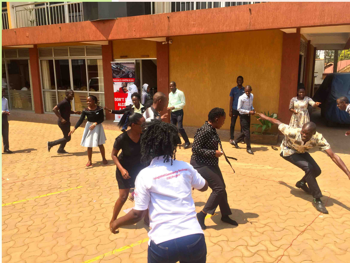
The Branch youth council stretch during the green house gasses game