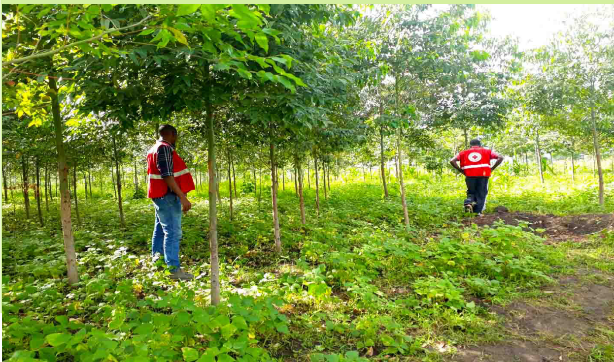
First phase of the trees that were planted in 2017