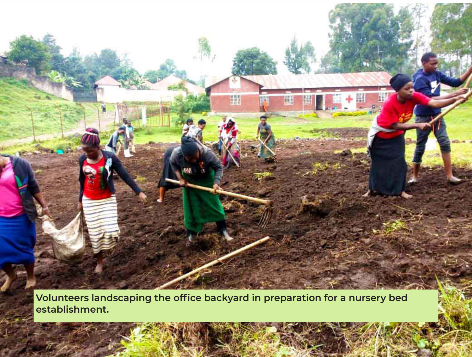
Volunteers landscaping the office backyard in preparation for a nursery bed establishment.