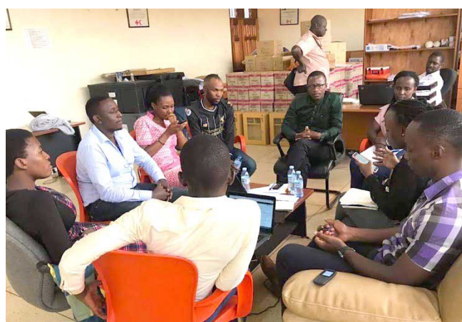
Y-Adapt Youth in Climate Adaptation Task Force Quarterly meeting