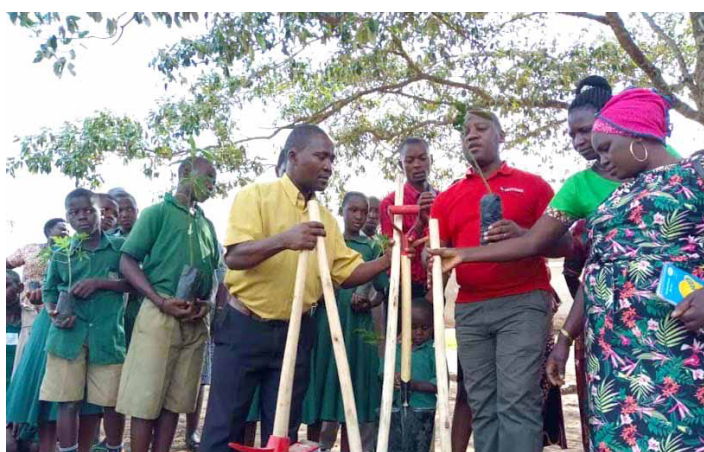
Youth and Women groups in Mbarara Receive Drought Resistant Fruit Trees in Isingiro