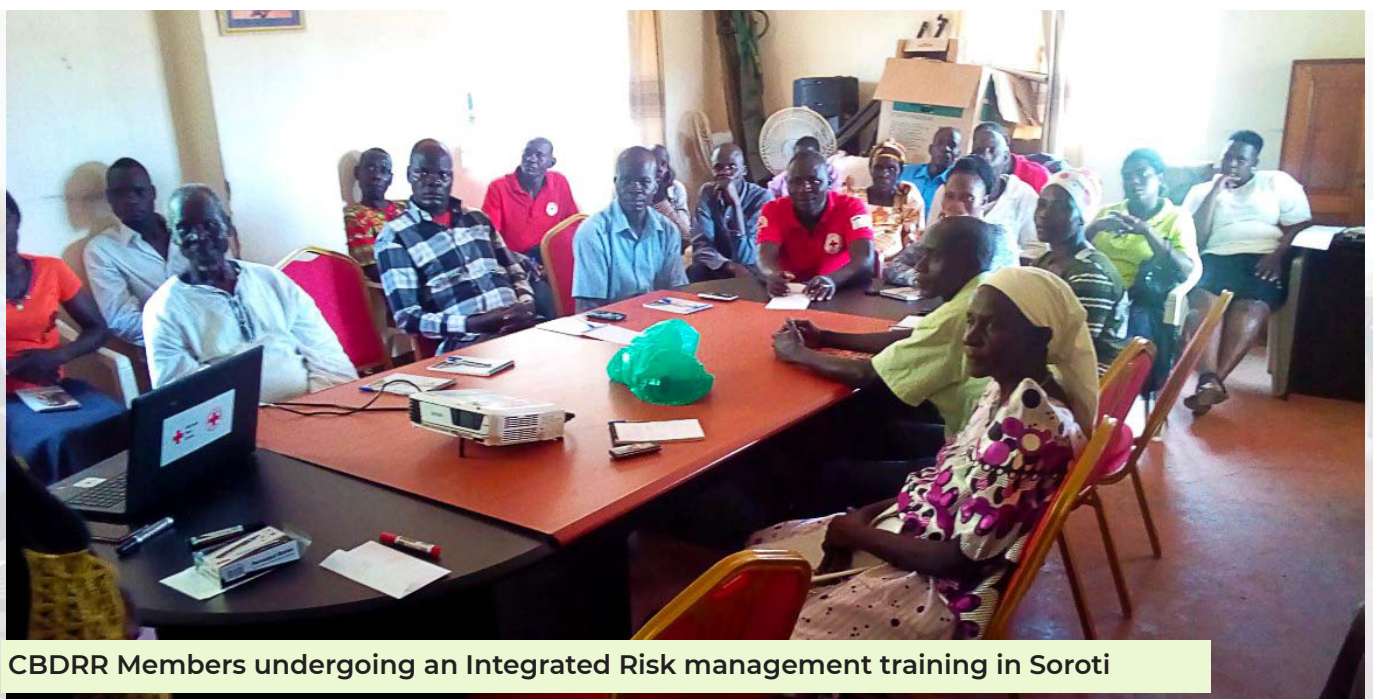
CBDRR Members undergoing an Integrated Risk management training in Soroti