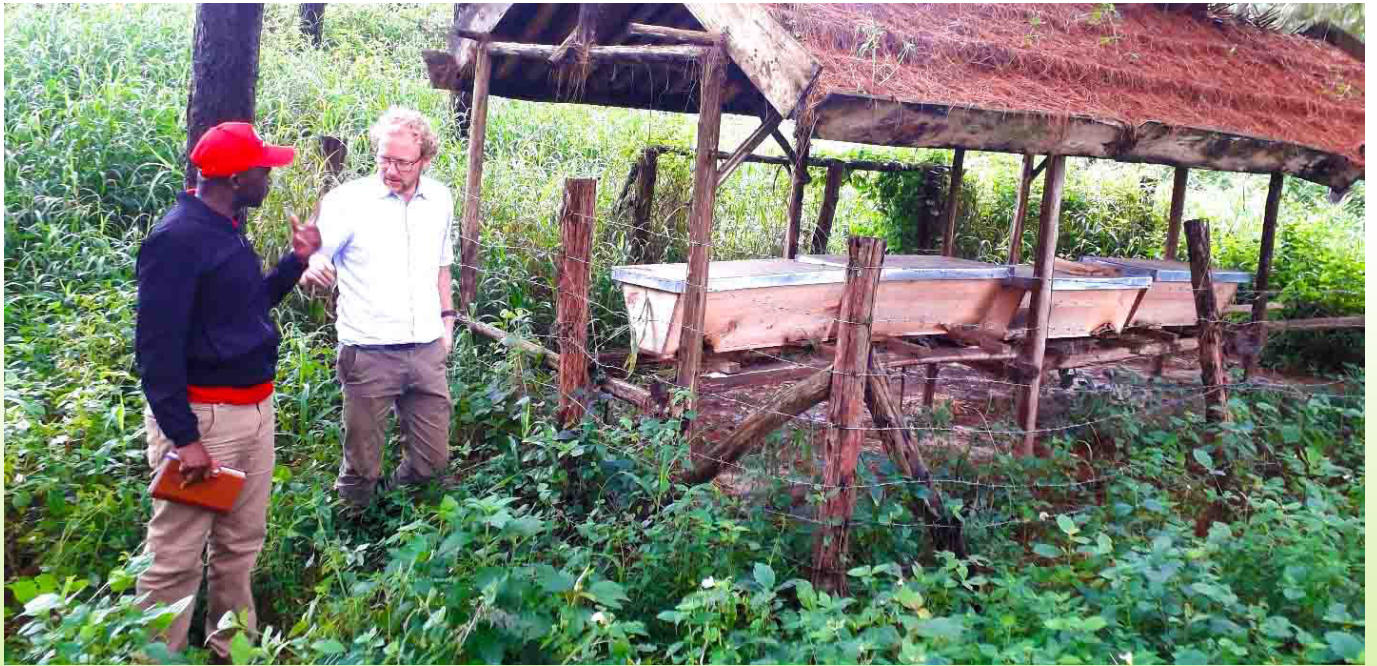
The Project Director Muhabura Diocese explains to the BM how best to manage the Apiary project Kisoro.