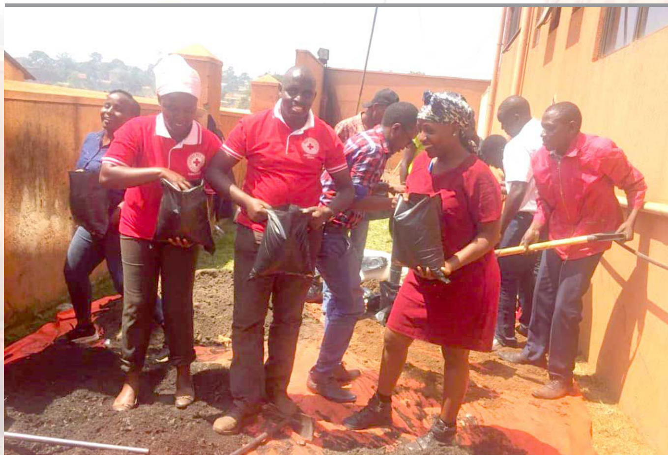
Team was filling the plastic bags with manure