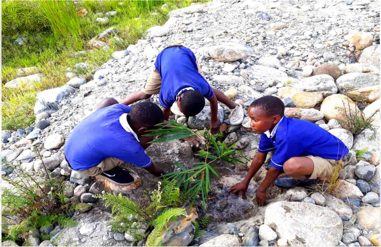
The pupils learning how to nurture the bamboo