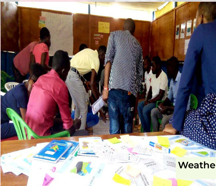
Weather and climate change challenge