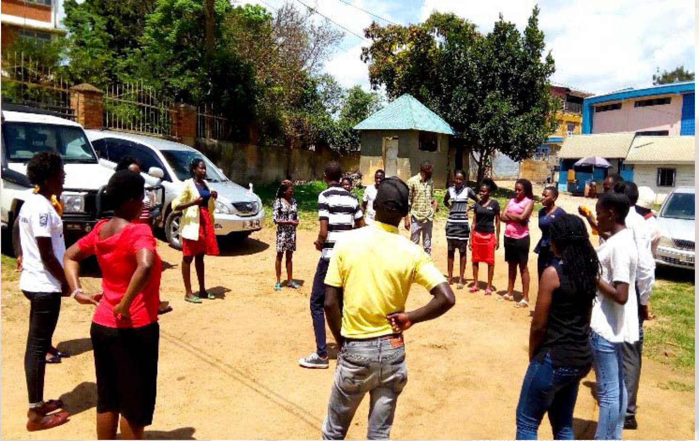
Greenhouse gasses emission challenge