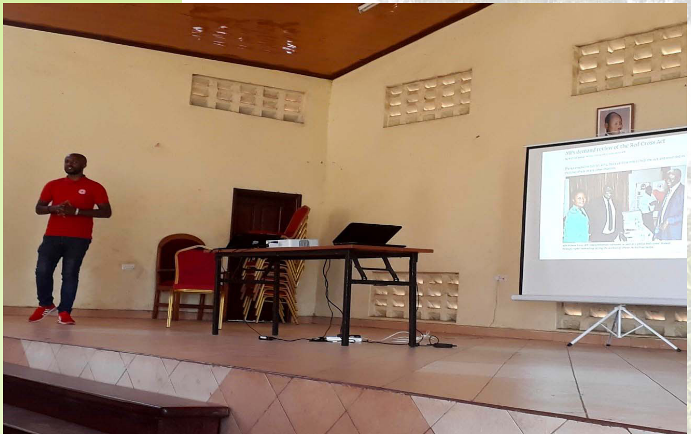
Brian kanahe making a presentation for the participants on the red cross act and ddmc roles