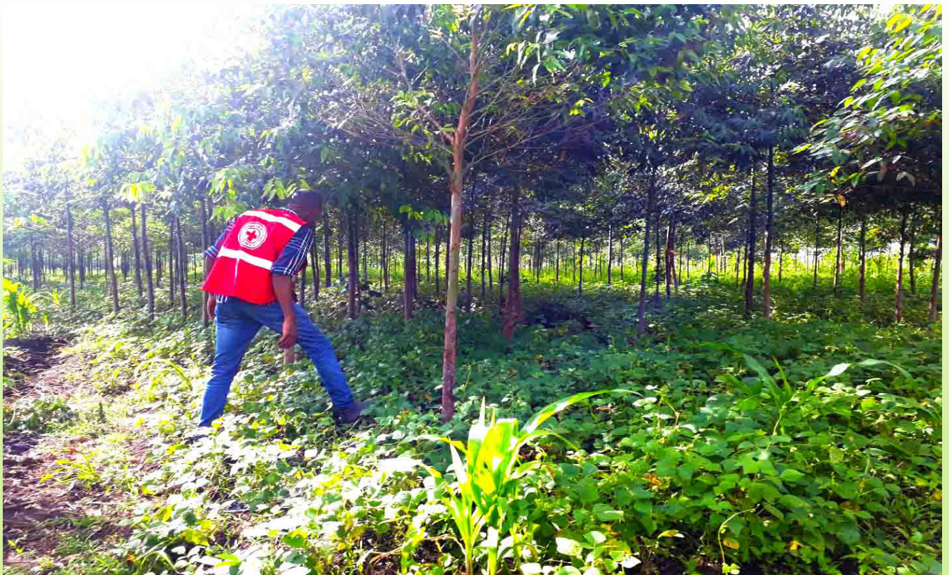
First phase of the trees that were planted in 2017