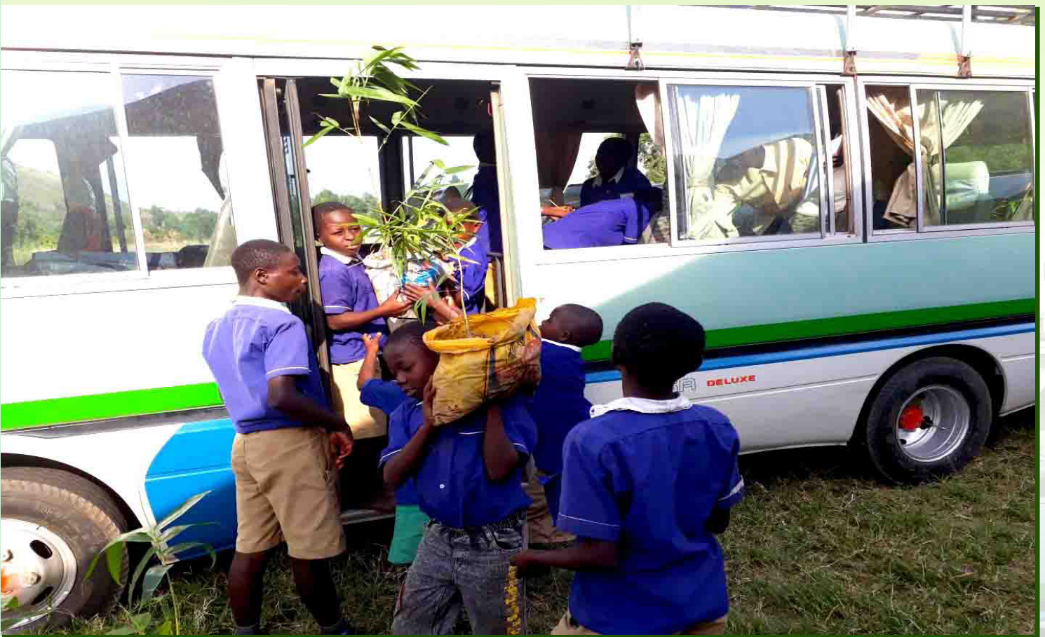
Pupils offloading the bamboo tree seedlings to plant along the river banks of R. Nyamwamba where their school is located