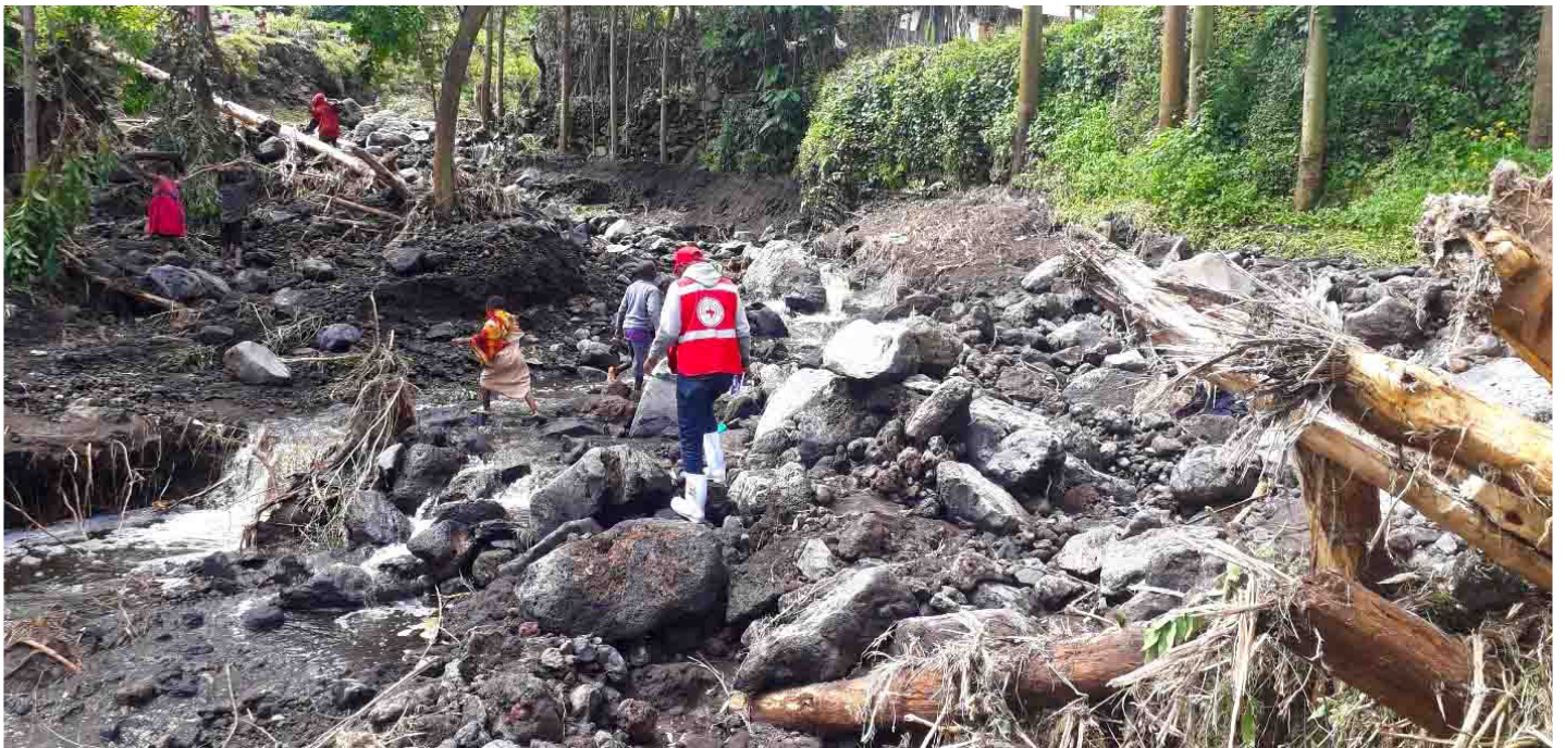
Joint assessment in Muramba Subcounty after a heavy down pour where running water from Mountain Muhabura swept away people's gardens.