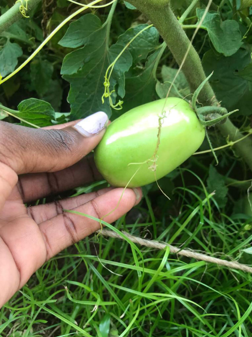
The fruits of the hard work