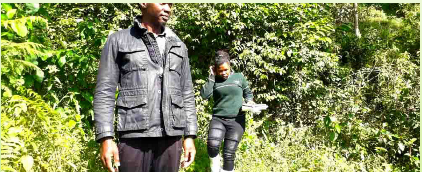
Y – adaptors conducting a feasibility study on branch land in Busanza for possibility of establishing an Apiary project.